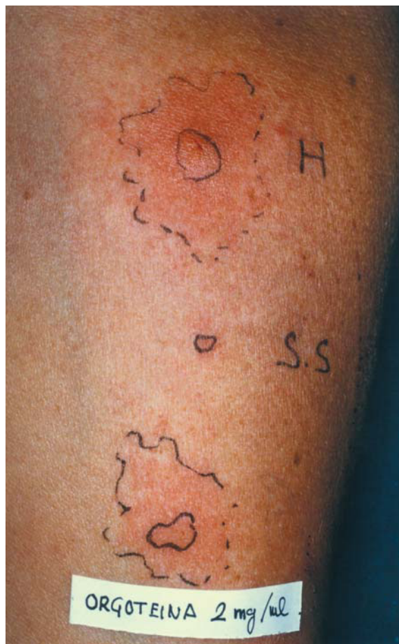
Figure 1.—Prick test to orgotein (Peroxinorm™) 2 mg/ml. H: Histamine 10 mg/ml. S.S: Saline solution.

Skin prick test produced a 9 × 6 mm papule pseudopods to Peroxinorm™ at 2 and 0.2 mg/ml (fig. 1), BSA (7 × 7 mm) and to cow liver extract (7 × 4 mm) but resulted negative with chymotrypsin,