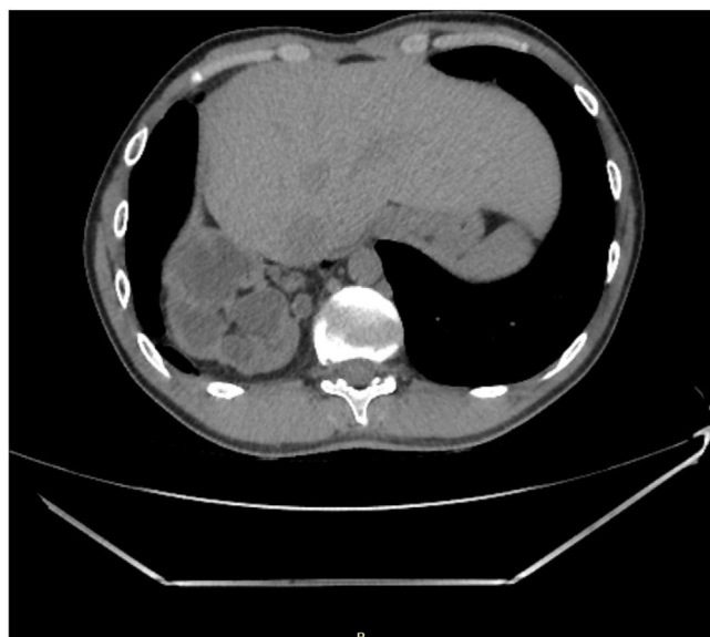
Fig. 1 – CT-Scan: right diaphragmatic defect. Intrathoracic grade III–IV hydronephrotic right kidney.

Given the findings, right nephrectomy and partial adrenalectomy were performed using Video-assisted Thoracoscopic Surgery (VATS) approach, under general anesthesia with double-lumen endotracheal intubation and contralateral one-lung ventilation. The patient was placed in left lateral decubitus position. Right-side four trocars were placed: at sixth intercostal space (ICS) at scapular line (5 mm), seventh ICS at mid-axillary line (11 mm), eighth ICS at scapular line (5 mm) and fifth ICS at anterior axillary line (11 mm) (Fig. 4). Pleuropulmonary adhesions were released. We identified the diaphragmatic defect, on which a mass was lodged in contact with the posterior thoracic wall, corresponding to the atrophic right kidney (Fig. 5). Right kidney pedicle was dissected and clipped with hem-o-loks®. The surgical specimen was extracted, after morcellation, through the 11 mm trocar orifice. The diaphragmatic defect, of approximately 6 cm, was closed with loose stitches of Surgidac™ with Endo Stitch™ device, and trans-parietal stitches with Endo-Close™ Auto Suture device. Also, a polypropylene mesh fixed with AbsorbaTack™ and a 28 Fr drainage connected to Pleur-Evac™ were place. The operating time was 360 min and intraoperative blood loss 100 ml. Urologists, thoracic and general surgeons were involved in the surgery. The drainage was removed after 48 h and patient was discharged at 72 h.