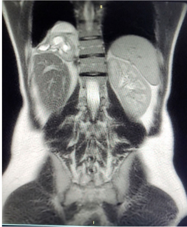
Fig. 3 – MRI: right diaphragmatic defect. Intrathoracic grade III–IV hydronephrotic right kidney due to ureteral involvement at the hernial orifice.

optimal surgical approach for right-sided defects is controversial.