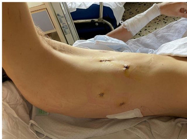
Fig. 4 – Trocar's colocation.

defects and herniation of retro-peritoneal organs, allowing even nephrectomy of atrophic kidney and mesh placement. We describe a right-sided VATS using laparoscopic ports and material. This approach was not previously reported in the literature for this indication. Its advantages include improved visualization of the posterolateral defect and triangulation capacity for pedicle dissection and intracorporeal suturing during mesh placement. Its use is limited by the experience of