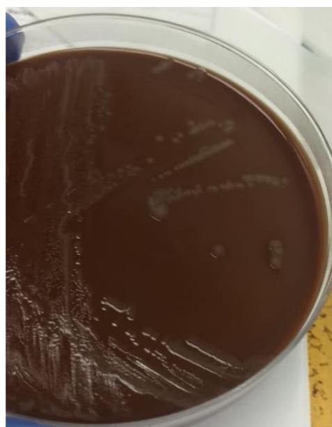
Fig. 2 – Chocolate blood agar growth medium showed the overgrowth of N. gonorrhoeae .