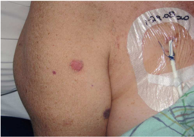
Figure 1 Skin lesions that developed acutely in a profoundly neutropenic woman who had received an allogeneic stem cell transplant 53 days before. The upper lesion was nodular and the lower one purpuric; both were painful.