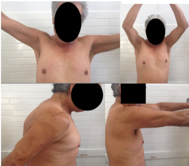
Figure 3 Follow-up after 9 months: Right shoulder range of motion: abduction: 0°–180°; abduction: 0°–90°, without pain; flexion: 0°–170°; extension: 0°–40°.

Ultrasound is a tool for the early diagnosis and treatment of septic arthritis of the acromioclavicular joint, 12 it can detect an increase in echogenicity, distension of the joint cavity, bone irregularity, as well as guiding punctures, similarly, septic arthritis of the acromioclavicular joint can be ruled out if the joint space is less than 3 mm. 15,16