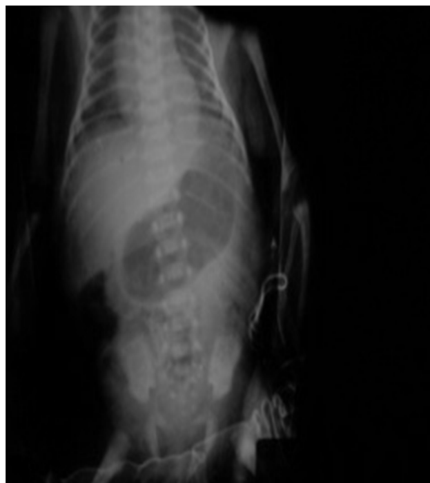
Figure 1 X-ray of abdomen and chest. Note the presence of gastromegaly.

Hypertrophic pyloric stenosis is a very rare condition in preterm infants. The literature describes an incidence rate