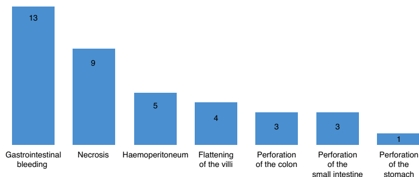
Figure 2 Most common autopsy findings in the NEC series.

Premature rupture of membranes and a history of urinary tract infections, which are significant risk factors for developing NEC reported in the literature, are consistent with the findings of this case series. In this study, 45% of pregnant women had a urinary tract infection in pregnancy. This is suggestive of poor prenatal care, which could lead to a greater risk of the neonate having NEC. Of the 24 patients, 17 were preterm (70.8%) (<36 weeks of gestation). This was the main risk factor for enterocolitis reported. The frequency of NEC was greater in male infants (66%) and infants born by vaginal delivery than in those born by Caesarean section (54%), although other articles have pointed to Caesarean birth as a risk factor for NEC. The current literature describes NEC