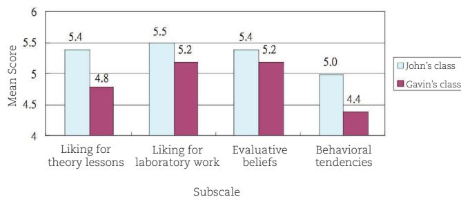
Figure 2. Mean scores on the four subscales.