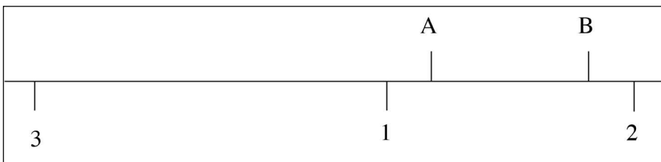
Figure 1. An example of stores and consumers' locations

Suppose that consumers 1 and 2 live within walking distance from A and B, respectively, whereas consumer 3 lives far from both stores. Clearly, B can attract consumers 1 and 3 only if the corresponding price (compared to that of A) is lower than the additional transportation cost of travelling from A to B. Probably, consumer 1 would need a car only if she chooses B while consumer 3 would need it anyway. Consumer 1's additional transportation cost of travelling from A to B is then larger