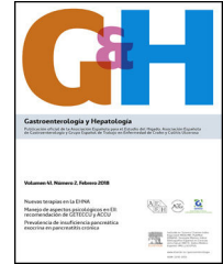
IMAGE OF THE MONTH