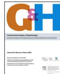
IMAGE OF THE MONTH