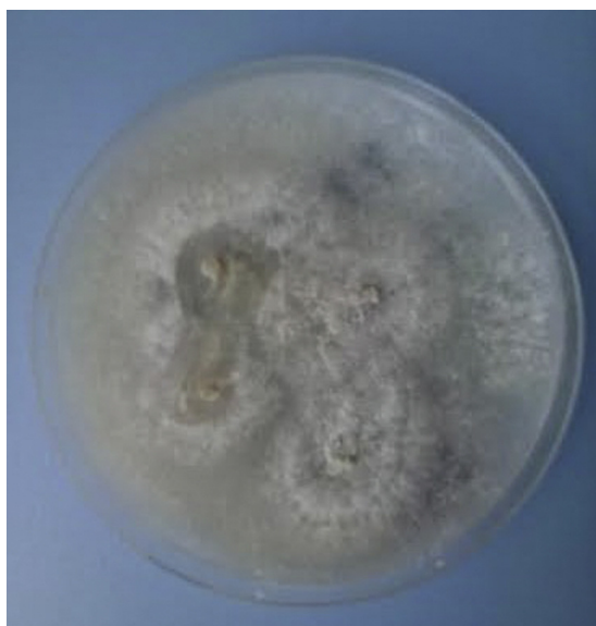
Fig. 3. N. hialinum colony in Potato Dextrose Agar.

residents in Spain, and had travelled to endemic areas. Its frequency in Spain is low, 3 although an increase has been observed in recent years mainly due to increased immigration from endemic areas, increased tourist travel to these areas and also due to improved clinical and microbiological diagnosis of ringworm caused by non-dermatophyte fungi. The increase in cases of this fungus leads us to believe it is a causing agent of nail and skin infections.