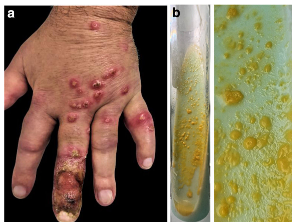
Fig. 1. (a) Clinical image: disseminated cutaneous papules distributed in a sporotrichoid pattern on the back of the left hand. (b) Culture: typical photochromogenic colonies of Mycobacterium marinum on Löwenstein-Jensen medium.

A 68-year-old Caucasian man with a history of Crohn's disease, taking azathioprine and adalimumab for 4 years, presented to our outpatient dermatology clinic with a two-month history of pain, edema, and erythema of the left-hand middle finger. The patient used to take care of his aquarium and a bonsai without wearing gloves, therefore having suffered a small traumatic wound on this finger caused by a dead fish. He had no response to previous treatment with amoxicillin-clavulanic acid, cotrimoxazole, and valacyclovir. Physical examination revealed an inflamed crusted lesion on the third left finger and multiple cutaneous papules, distributed in a sporotrichoid pattern on the back of his left hand, and on his third, fourth, and fifth finger (Fig. 1a). There was no