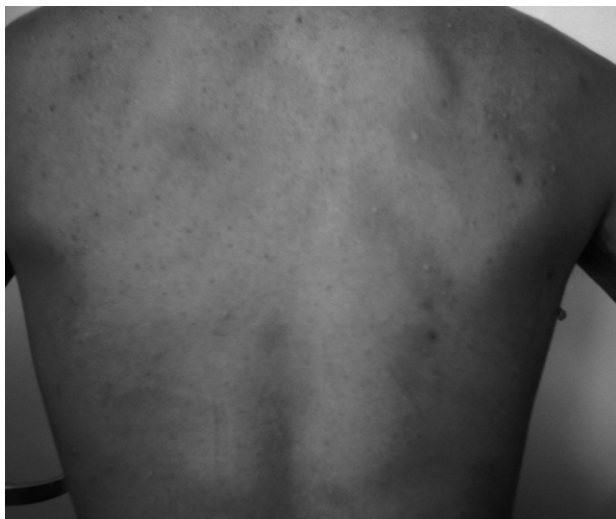
Figure 1.—Hives after oral challenge ES.

NaPO 3 , NaSO 3 , NaCl, neohesperidine, potasic aceulfam and orange flavouring.