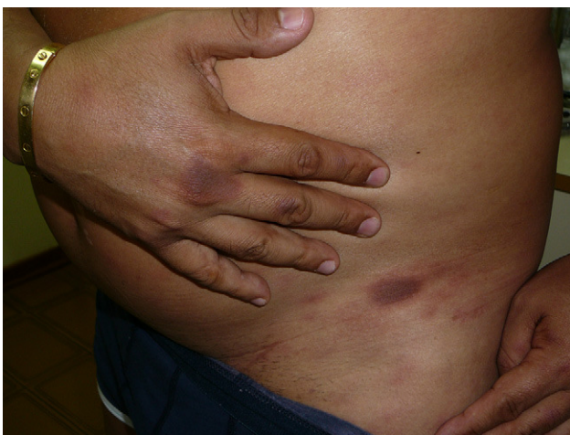
Figure 1 Erythematous and hyperpigmented plaques on the right hand and left groin.

A 51-year-old male patient consulted because he noticed recurrent rounded erythematous and hyperpigmented plaques in the same anatomic areas for the last five years. The lesions were localised in the back, posterior surfaces of the thighs, dorsal aspect of the right hand, and lumbar region. The patient referred that he had similar lesions at the same sites in multiple occasions every time he took self-prescribed metronidazole for non-specific gastrointestinal complaints such as abdominal pain and meteorism. At the time he consulted to the allergy clinics he had lesions with the same characteristics as described above that had appeared four days after starting treatment with oral ketoconazole, 200 mg/d, which was prescribed for tinea pedis (Figures 1 and 2).