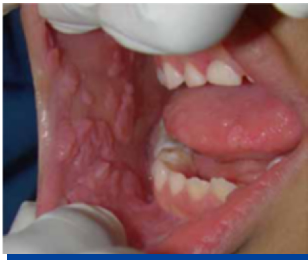
Figure 1. Multiple papules, located in the buccal mucosa, labial and the anterior third of the tongue.

lesions in lower labial mucosa, buccal mucosa and tongue, but with a decrease in diameter and height, then five applications were performed every fortnight noticing in control number 6 a completed resolution of lesions and all the characteristics of a healthy mucosa, such as good elasticity, pale pink mucosa, vascularized, moist and shiny (Figure 3). It's no sign of recurrence after one year follow up.