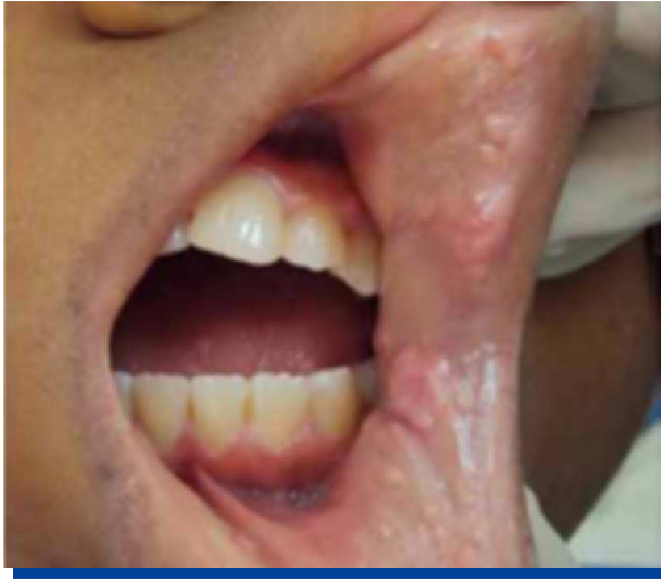
Figure 5. Multiple papules on lip, buccal and tongue mucosa.