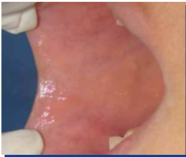
Figure 3. Clinical control observing full resolution of the lesions and all the features of a healthy mucosa.