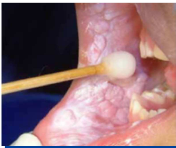
Figure 2. Trichloroacetic acid application over the lesions at 80%.