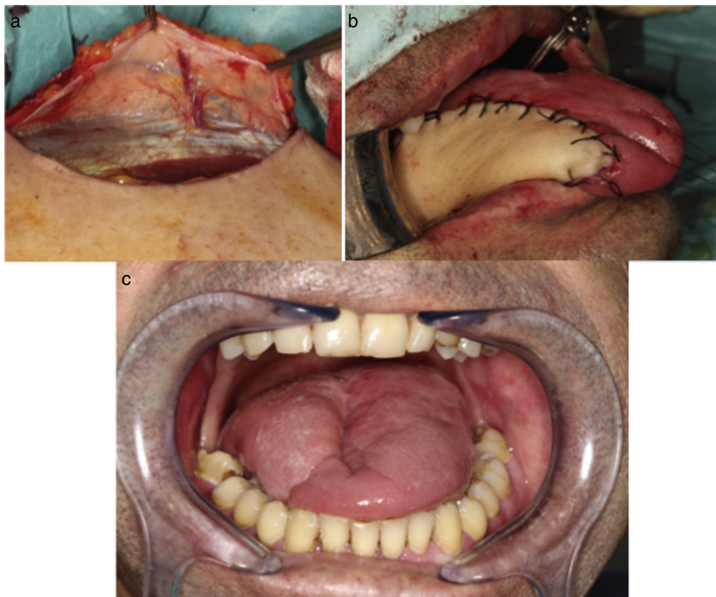
Fig. 3 – (a) Medial sural perforator artery, (b) immediate post-operative reconstruction and (c) postoperative follow up, good cosmetic outcome with a medial sural perforator flap and no recurrence.

An incisional biopsy was repeated on January 2015 after a first negative result; the histopathology showed an infiltrating spindle cell tumour that stained for smooth muscle actin. The immunohistochemistry stained positively with smooth muscle actin, desmin, and caldesmon (Fig. 2).