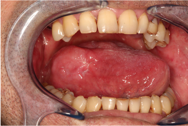
Fig. 1 – Clinical photograph showing the mass within the right side of the tongue.