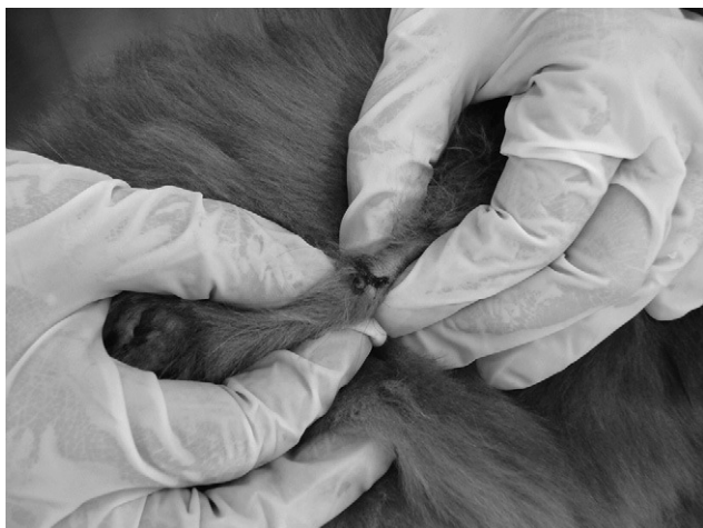
Fig. 1. Relapse of dermatophytic pseudomycetoma lesions showing small nodules throughout the dorsum region with bloody and granular discharges.

feline was considered to be in good condition and remained alert but presented focal areas of alopecia throughout the body. The dorsum region showed small nodules with one of a larger size (3 cm \varnothing ) near the tail, ulcerated and presenting a yellow granular discharge. After the clinical examination, exudates were vacuum collected directly from the lesions. Tests were run to determine the hematological profile as well as for the detection of the feline leukemia virus. Isolates of M. canis were obtained from exudates, skin and hair specimens.