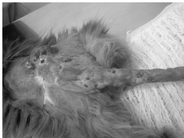
Fig. 3. Formation of several coalesced nodules of different diameters (2.5–5.0 cm) on the dorsum region and base of tail. Nodules show granular discharges.

thin septa, containing 6–15. These findings made the identification of M. canis possible.