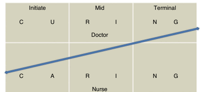
Figure 1 The pathway of end of life, and physicians-nurses responsibilities 1 .

Nurses is a caring profession, they do not do an invasive procedure as part of their interventions. However, nurses prefer to do invasive activities such as insertion urethra catheter or nasogastric tube catheter instead of practice caring such as respect to others, compassion, advocacy and intimacy to the patients and families 10 . As a result, the basic