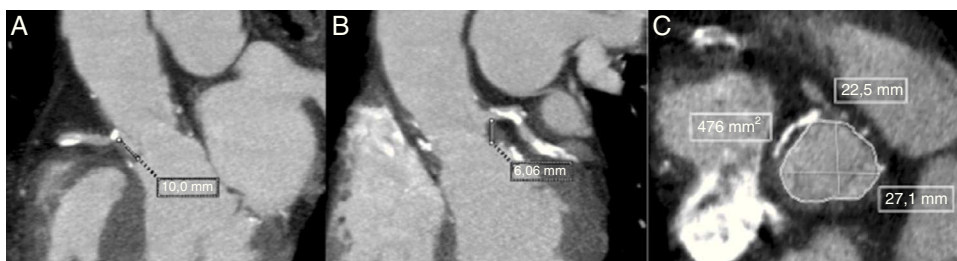
Figure 1 Multi-detector computed tomography (MDCT) evaluation pre-TAVI showing the measurements in the long-axis view with a height of 10 mm for the right coronary artery (A) and 8.06 mm for the left coronary artery (B). Measurements of the sinus of Valsalva were obtained from the mean of the maximum and minimum cross-sectional diameters in the short-axis view (C).

A final angiogram showed (Fig. 2) no significant residual coronary stenosis and coronary flow TIMI 3. Following the procedure, the patient had an excellent recovery and was discharged four days later. At 6-month follow-up the patient was in NYHA class I, with a normofunctioning valve (mean gradient 20 mmHg, valve area of 1.1 cm 2 , and mild paravalvular leak), and left ventricle ejection fraction of 55%. Cardiac CT demonstrated the permeability of the coronary stent with a good position of the SAPIEN XT valve.