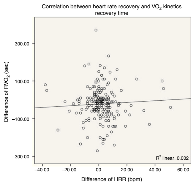
Figure 2 Abbreviations: Recovery of oxygen uptake (RVO 2 ) and heart rate recovery (HRR). This scatter plot shows an absence of correlation between heart rate recovery and the recovery of oxygen uptake, ( R^2 = 0.002 , p = ns ).

multivariable analysis was PMPHR. In contrast, those variables associated with RVO 2 were: diabetes mellitus and sedentarism.