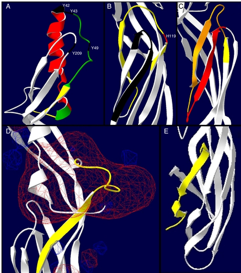
Fig. 2 – View of the epitopes in the 3D structure of Clostridium perfringens type D ETX. (A) Epitope 3. The yellow, green and red colors represent low, medium and high reactivity of regions, respectively. (B) Epitope 9 is shown in yellow; the determinant mapped by McClain and Cover 15 is shown in black. (C) Epitope 9 is shown in yellow; the essential domain for ETX activity is shown in red; the overlapping region between this domain and epitope 9 is shown in orange. (D) Epitope 12 is shown in yellow; the negative electrostatic potential is shown in red; the positive electrostatic potential is shown in blue. (E) Epitope 15 is shown in yellow.

epitope. In addition, this epitope is located in domain I of C. perfringens type D ETX and is located in the amino-terminal region of the toxin (Fig. 2A). This region, which is mostly composed of a long alpha-helix, is believed to contain the toxin interaction site that binds to receptors present in target-cells. 3,12 Thus, it is possible that neutralizing antibodies produced against ETX bind primarily to the amino-terminal region and prevent this toxin from adhering to cell receptors.