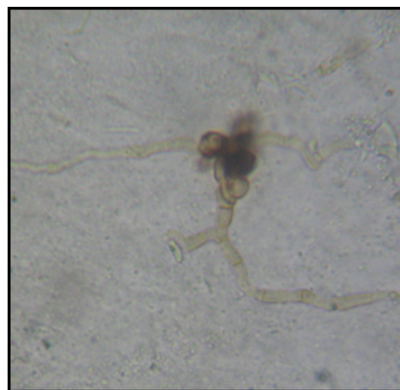
Fig. 2 – Direct mycological examination: clinical sample clarified with 20% KOH, exhibiting thick and dematiaceous septate mycelial filaments.

After the resection surgery, the patient did not need to use an antifungal drug to treat the phaeohyphomycosis, and no follow-up radiotherapy was needed to treat the squamocellular carcinoma (Fig. 1B).