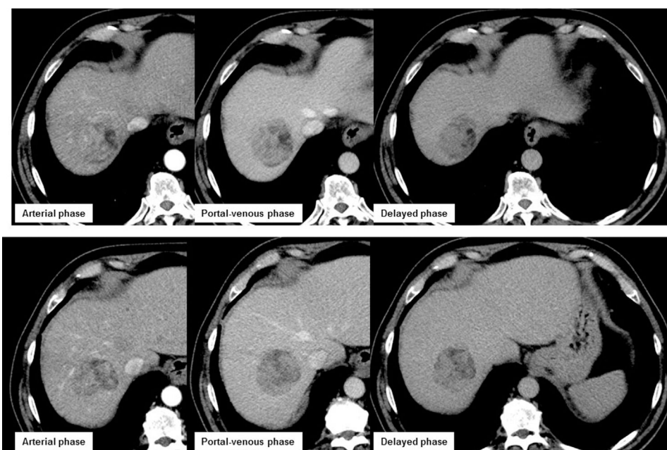
Fig. 2. Atypical CT-scan results in a HCC nodule 51 mm in size. Not homogeneous contrast uptake during the arterial, portal-venous and delayed phase.

5.5 cm HCC. The sensitivity increased to 77% (IC95% 69–86%) considering typical contrast enhancement pattern for HCC also an inhomogeneous hyperenhancement followed by wash-out, without any change in specificity, with a diagnostic accuracy increased to 83%. This approach further decreased the need for histological characterization to 45% of all US-detected nodules.