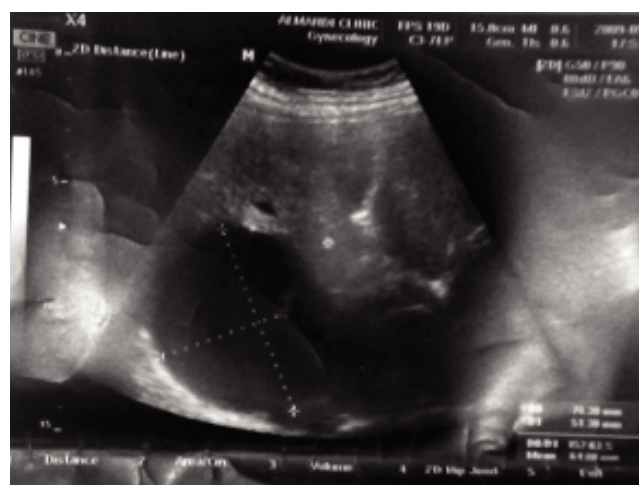
Figure 1. Sonographic view of a type II hydatid cyst.