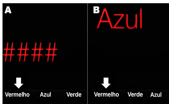
Fig. 1. Screen of the EncephalApp Stroop Test (Brazilian Portuguese version). A) OFF mode: the symbols are in red and the patient must choose the button “Vermelho” (which means red). B) ON mode: the word “Azul” (which means blue) is written in red and the patient must touch the button showing the color name he sees (“Vermelho”), not the written word. White arrows show the correct answer on each mode. Notice that the position of the colors at the bottom changes randomly.

takes a few minutes to be applied. The task has two components: “OFF” and “ON” states, depending on the concordance or discordance of the colored stimuli. In the easier “OFF” state, the patient is subjected to red, green, or blue hashtags and must choose as quickly as possible by touching the matching color among multiple-choice buttons at the bottom of the screen. The color names are also randomized and not fixed to their respective positions (Figure 1A).