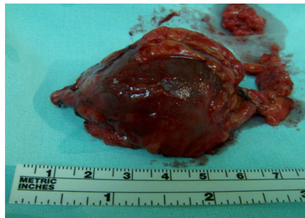
Figure 3 Thrombosed internal saphenous vein venous aneurism.

the vein's diameter is twice as large as the normal diameter, then it is considered to be an aneurysm (the saphenous vein's normal size at the saphenofemoral joint is 3–5 mm, 2–4 mm at the thigh and 1–3 mm at the ankle). 8 Nevertheless, in order to consider it a primary venous aneurysm size is not the only factor considered. It must also be a localized dilation, conformed by three histological layers which constitute the normal venous wall. This could be saccular or