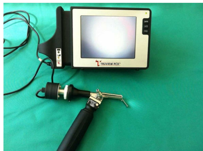
Figure 2 - Truphatek TruView EVO2 system with attached video monitor (Truphatek International Limited, Netanya, Israel).