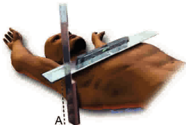
Figure 1 - Measurement A) The maximum anteroposterior measurement at the level of the distal third of the sternum.

In these individuals, the Anthropometric Index for PEX (AI) (15,17) was defined as measurement B divided by measurement A ( AI=B/A ). Weight, height, and thorax circumference at the DT were statically analyzed using Prism software, version 5.2 (Graphpad Prism, USA).