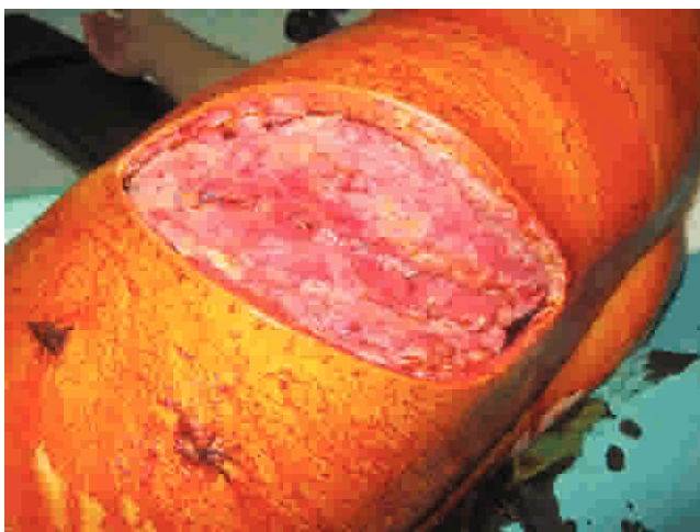
Figure 2 - A patient's necrotic and suppurative tissues, including the skin, subcutaneous tissue and muscle layers, were observed before debridement. Only the pericostal sutures were intact.

An en block approximation technique combined with debridement was performed under general anesthesia in 16 (66%) of the DTI patients. In two patients, superficial general anesthesia was provided because these individuals did not appear to tolerate intratracheal general anesthesia because of their poor general health status. Debridement and suturation were performed in eight patients with local anesthesia. Pathogenic microorganisms were isolated from the cultures of six of these eight patients. The improvement was complete in the patients whose interventions were conducted under local anesthesia. Successful results were obtained in 14 (87.5%) of the 16 patients whose en block approximation was performed under general anesthesia.