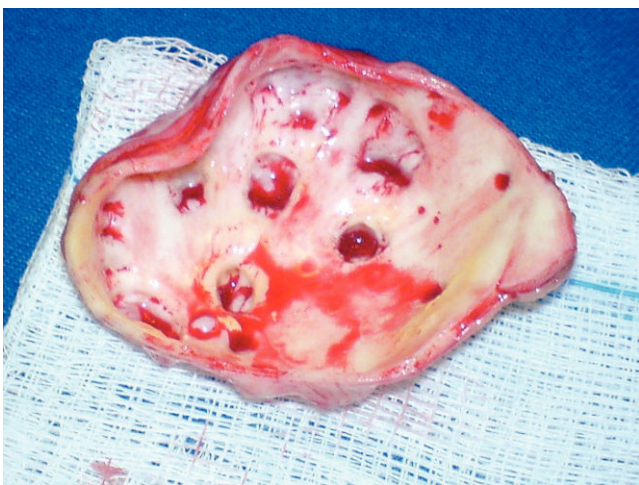
Figure 2 - Internal macroscopic aspect of the ascending aorta segment. Note the multiple focal cavities of different sizes corresponding to the external dilations.

The histopathological findings were ascending aorta with areas of intimal fibrosis with dystrophic calcification consistent with arteriosclerosis. Areas of medial cystic degeneration with saccular dilations were observed to be diffusely distributed; inflammation was absent (Figure 3-A,B,C). The