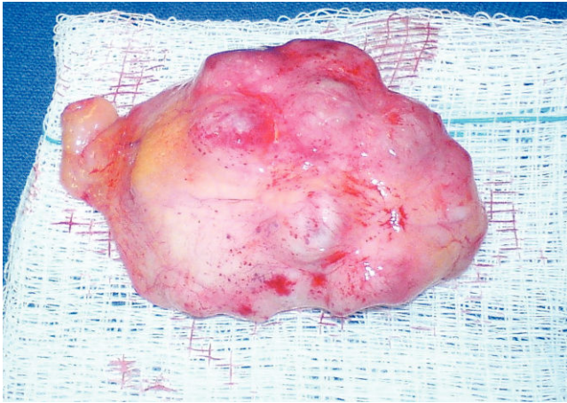
Figure 1 - External macroscopic aspect of the ascending aorta segment.

Antegrade cold blood cardioplegic solution was infused every twenty minutes. The three thickened aortic leaflets, as well as the anterolateral convexity and anteromedial concavity of the aorta were excised, leaving the posterior one third, macroscopically normal, to serve as support tissue to the vascular prosthesis that would be placed. Samples were submitted for histological study, and the procedure was completed. The prosthesis implanted was a mechanical no. 21; a Dacron tube prosthesis (no. 24) was positioned in replacement of the ascending aorta above the coronary ostia. De-airing was performed through a catheter placed in the tube; the aortic cross-clamp was removed. As the heartbeats became effective, the cardiopulmonary bypass was ended, and the surgery was finalized as usual. The patient was sent to the intensive care unit, where he remained for one day. He was then discharged by the tenth day in good health. He recovered and has lived until the present moment without complications.