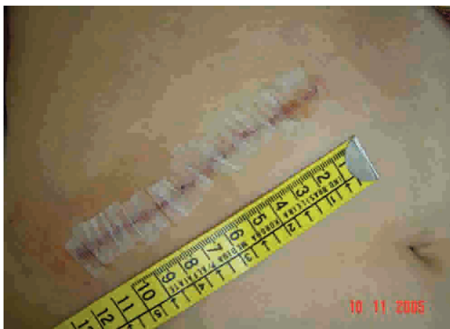
Figure 1 - The mini subcostal approach for donor nephrectomy: An incision of 10 cm is made about 3 cm below the last costal arch in the right flank.

In procedures involving the right kidney, the renal vein was cut near its insertion in the lower cava vein, and a direct 4-0 polypropylene suture was used for vena cava repair. On