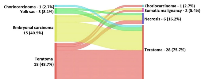
Fig. 1. Primary tumors are represented on the left and metastasis in the right. (n = 37 patients). Color code: Choriocarcinoma – light blue; Yolk sac – green; Embryonal carcinoma – yellow; Teratoma – red; Somatic malignancy – pink; Necrosis – dark blue.

Operative mortality was low among these young male patients, with no surgical deaths. Two patients died after over five years of the surgical procedure, one of renal failure due to disease progression and chemotherapy toxicity, and the other one died of renal failure due to late complications of abdominal trauma surgery, not related to the intrathoracic