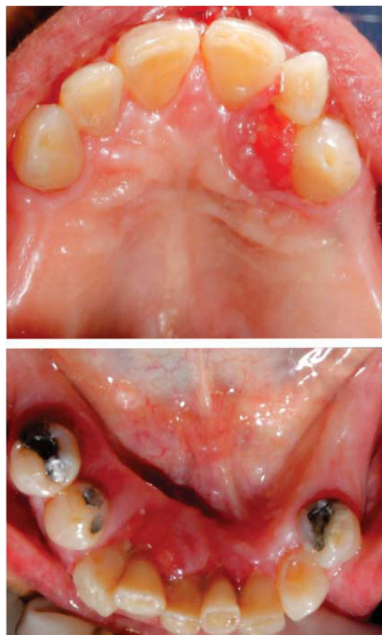
Figure 2. Upper and lower occlusal view.

vestibular gingiva surrounding tooth number 2.1 with presence of suppuration ( Figures 1 to 3 ). The lesion appeared as a sessile, erythematous mass with spontaneous bleeding, measuring approximately 1 × 1 cm, with a 6 mm periodontal pocket. Serial periapical X-rays were taken which revealed horizontal bone loss at upper and lower incisors ( Figure 4 ).