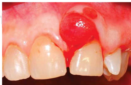
Figure 3. Upper front view of gingival enlargement.