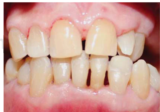
Figure 7. Re-evaluation of periodontal health circumstances 3 months after treatment.