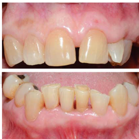
Figure 5. Upper and lower front view one month after treatment. Full resolution of gingival enlargement.

The following was observed at this re-evaluation: 5.5% percentage of periodontal pockets, with depth of up to 5 mm, presence of grade 1 mobility in lower anterior teeth, absence of suppuration, oral hygiene index of 40% (O'Leary: Poor) ( Figure 7 ). Periodontal maintenance therapy was once more conducted with manual instrumentation. The following re-evaluation appointment was programmed for three months later.