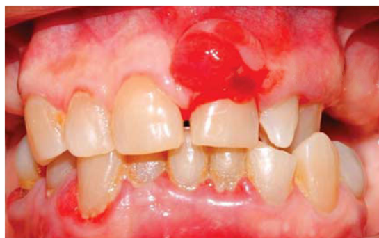
Figure 1. Front view: generalized chronic periodontitis and gingival enlargement at the level of tooth 2.1.