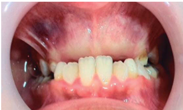
Figure 1. Clinical appearance of initial anterior-superior area.

Odontomas are benign tumors frequently found in the mouth. In most cases, they do not exhibit