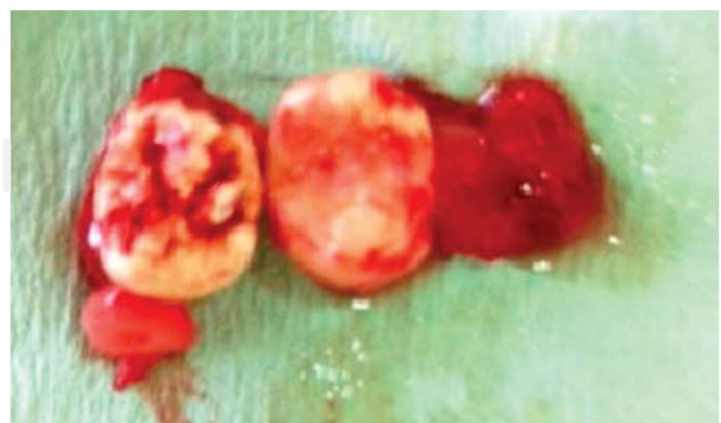
Figure 4. Extraction of lower supernumerary teeth in the premolar area.