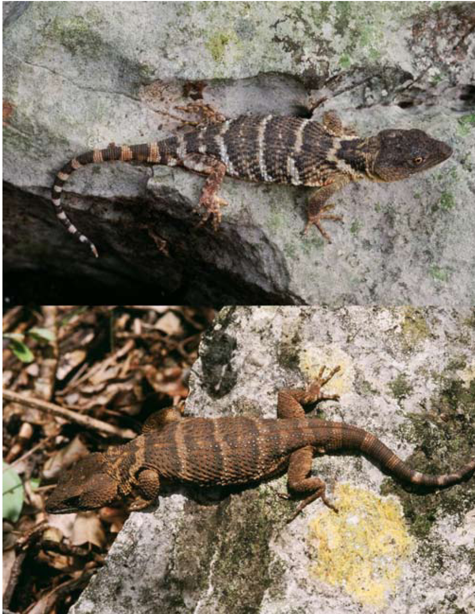
Figure 3. Xenosaurus mendozai in life.

Narrow, U-shaped, solid black collar on posterior half of neck, extending anterolaterally to near ear on each side; connected along midline to posterior end of head by narrow, black middorsal line. Neck collar bordered anteriorly by pale brown subocular stripe extending dorsomedially from ventral half of tympanum to black middorsal line on each side; bordered posteriorly by wide, pale stripe extending posterodorsally from gular fold on each side, nearly fusing