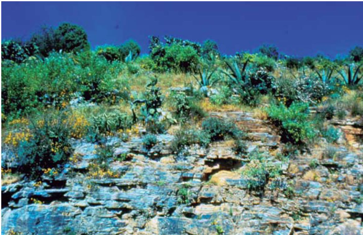
Figure 5. Habitat of Xenosaurus mendozai at Acatitlán de Zaragoza, Querétaro. From slide taken by José Antonio Hernández Gómez.

Three xenosaurid species are listed by the Mexican government as “under special protection” given their rarity and isolated and patchy geographic distributions ( X. grandis , X. platyceps , and X. newmanorum ; Nom-059-Semarnat-2010 Xenosaurus mendozai also deserves conservation attention and therefore we recommend that this new taxon be added to the above list. However, given that this species is clearly microendemic with low