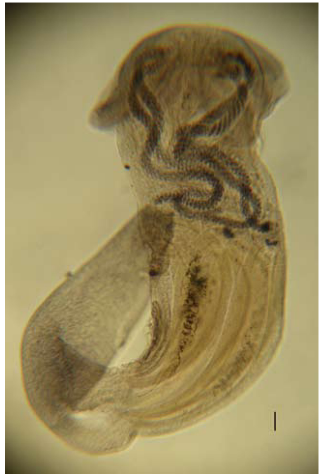
Figure 2. Micrograph of the larval cestode from Euphausia americana . Scale bar: 0.06 mm.