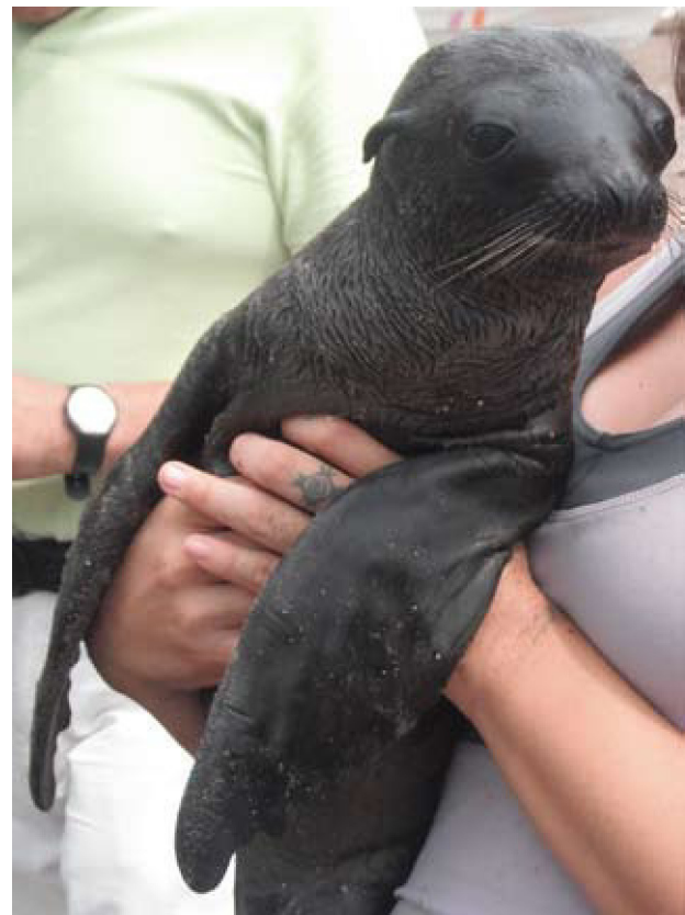
Figure 2. Neonate California sea lion ( Zalophus californianus ) found on La Boquita beach, Manzanillo, Colima, Mexico. Remains of the umbilical cord are visible on the ventral side of the individual.

atypical sea lions sightings around Manzanillo region. An unusual sea lion sighting previously occurred off the coast of Colima between July and November, 2008. The individual was a subadult Steller sea lion ( Eumetopias jubatus ), whose presence was attributed to the drop in SST caused by the 2008 La Niña event (Ceballos et al., 2010). Taken collectively, this and other similar sightings in the future could have important repercussions in terms of conservation management.