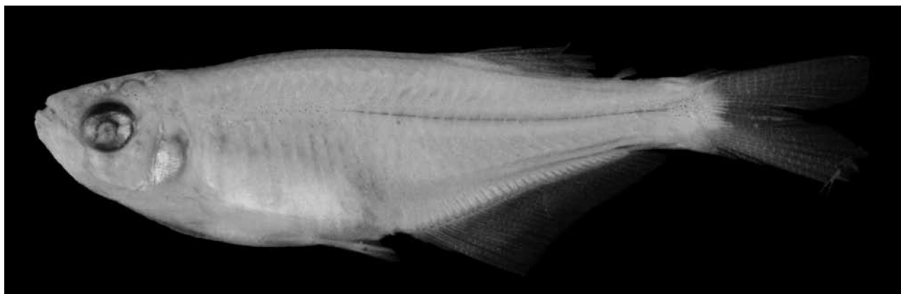
Figure 1. Gephyrocharax valencia , male, UWIZM 2010.14.253, 25.34 mm SL, Moriquite River, southern coast of Trinidad.