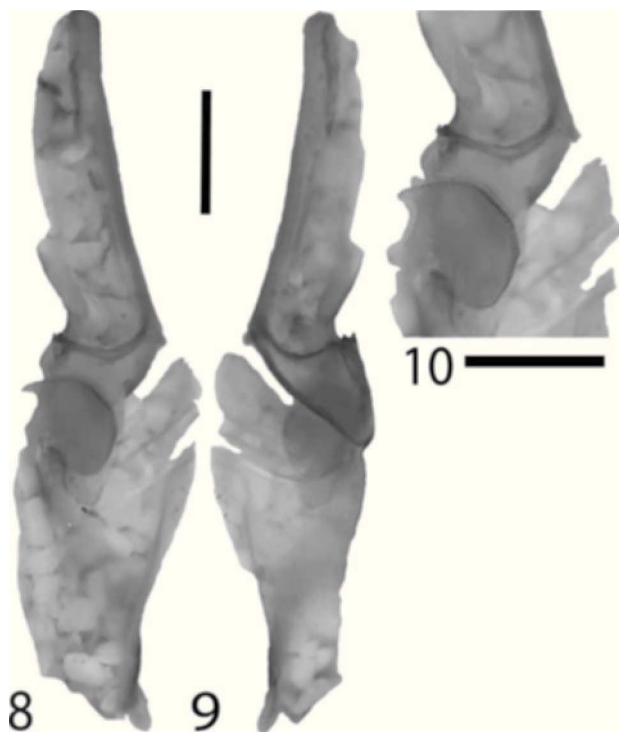
Figure 8-10. Right hemispermathophore of V. coalcoman sp. n.; 8, mesal view; 9, ectal view; 10, detail of capsular region showing semicircular internal lobe. Scale bars= 1mm.

settlement on the road from Coalcomán to Dos Aguas, in the Sierra de Coalcomán (Fig. 11).