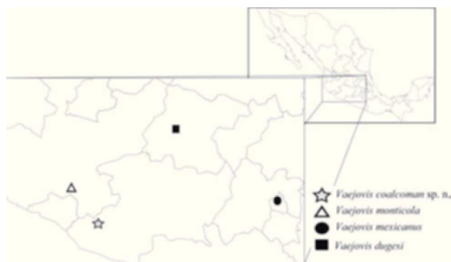
Figure 11. Known distribution of V. coalcoman sp. n. (star), V. monticola (triangle), V. dugesi (square) and V. mexicanus (circle).

13); in V. dugesi females it is 13-14 (N= 4, mode= 13); in V. mexicanus in males it is 17-20 (N= 6, mode= 18), in females is 15-17 (N= 6, mode= 16) and in V. monticola in males it is 13-15 (N= 4, mode= 15) and in females it is 10-13 (N= 4, mode= 12).