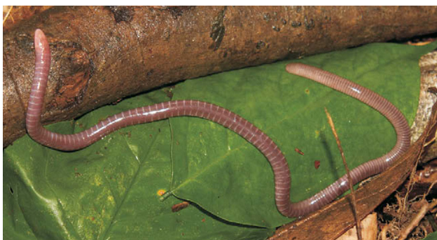
Figure 2. Specimen CNAR-IBH 26015, first finding of the caecilian Gymnopsis syntrema in Mexico from Ruinas at the Montes Azules Biosphere Reserve, Municipality of Ocosingo, Chiapas, southern Mexico (16°06'35.21" N, 91°00'59.10" W; 300 m elev.).