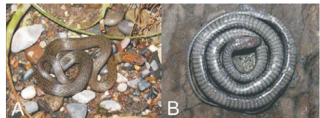
Figure 2. A, male A. sapperi encountered at the locality La Cueva, Municipality of Pisaflores, Hidalgo. B, ventral view of the specimen reported.

The data on scutellation, morphometrics (body and tail lengths), and coloration for this specimen are mostly within the ranges described in the original description of