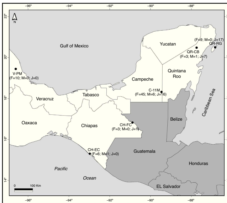
Figure 1. Map of sites where Brachypelma vagans was observed in Southeast Mexico. F, numbers of female individuals; M, number of male individuals; J, number of juvenile individuals. For codes of sites see Table 1. The number of wandering males found close to but not inside each sampling area is not considered in this figure.

in the Lacandona rainforest. In Campeche, we visited 1 site (11 de Mayo; C-11M; 18°18'N, 89°27'W, 281 masl) close to the Calakmul Biosphere Reserve. In Quintana Roo, we visited 2 sites, 1 on the mainland (Coba; QR-CB; 20°28'N, 87°44'W, 13 masl) and 1 on Cozumel Island (Rancho Guadalupe; QR-RG; 20°29'N, 86°50'W, 17 masl). We also recorded data from a site in Veracruz (Paso de Milpa; V-PM; 19°26'N, 96°36'W, 260 masl). Collections were made at the beginning of the rainy season for Chiapas and Yucatán Peninsula, which is between May and July. The start of the rains coincides with the reproductive season. All the sites studied were rural communities with similar ecological characteristics: deep clay soil with little vegetation, roots, and limestone rocks (Machkour-M'Rabet et al., 2005, 2007). Climatic characteristics were very similar for all study sites (Table 1).