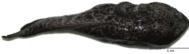
Figure 1. Collected specimen of Sanopus reticulatus , dorsal view (Yuc-pec-356).

were collected because of the advanced state of decomposition. Additionally, we collected 2 adult S. reticulatus in Celestún while scuba diving on September 26, 2015. The specimens were deposited in the Colección ictiológica regional de referencia UMDI Sisal (Semarnat Yuc-Pec 239-01-11) of the Unidad Académica Yucatán, Universidad Nacional Autónoma de México, under collection numbers Yuc-pec-356 and 357.