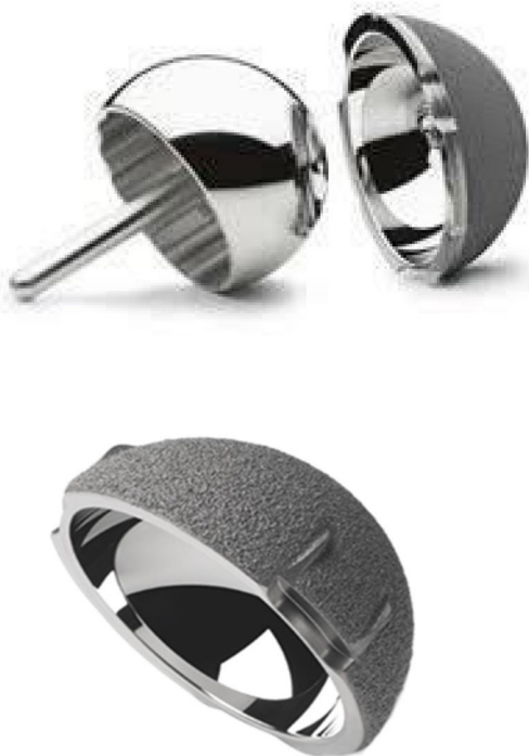
Figure 1 Durom system and the MMC version.