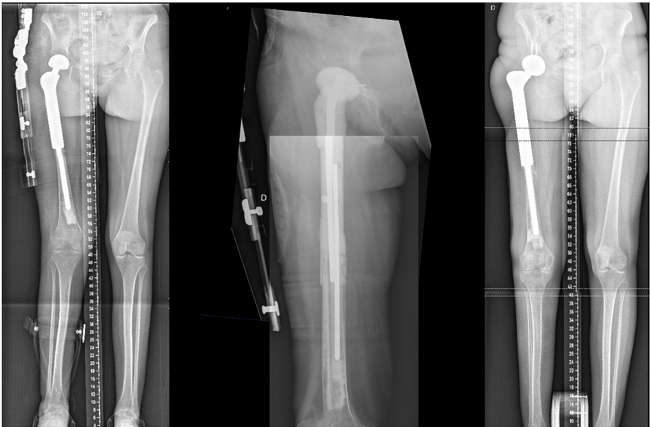
Figure 2 Customized hip cement mega-spacer for a hip megaprosthesis septic two-stage revision surgery after proximal femur chondrosarcoma (preoperative, 1st stage, and 2nd stage).