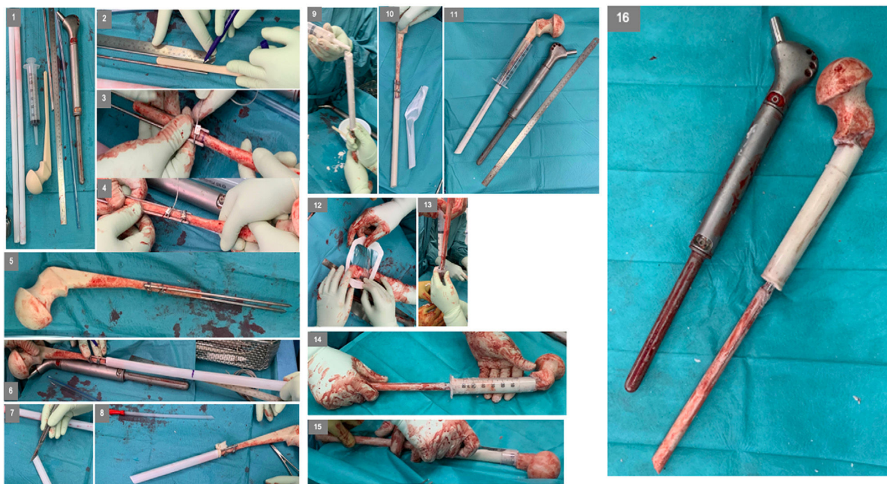
Figure 1 Customized hip cement mega-spacer for a hip megaprosthesis two-stage revision surgery. (1) Material, (2) measure first interphase, (3) Steinman cerclage no. 1, (4) Steinman cerclage no. 2, (5) hip spacer – Steinman construct, (6) measure check, (7) cut according to measurement, (8) glove cement stop, (9) first interphase cementation, (10) plastic tub extraction, (11) preparation of second interphase cementation, (12) dressing cement stop, (13) second interphase cementation, (14) cemented second interphase, (15) syringe tub cut, and (16) final result compared to explanted megaprosthesis.

a proximal femur II/III chondrosarcoma requiring surgical treatment with marginal resection and a double mobility hip megaprosthesis. Postoperative radiotherapy was done for 6 months with no evidence of periprosthetic infection or tumor recurrence. In the following years, he was diagnosed of loosening requiring revision surgery with negative intraoperative cultures. After 2 months, he presented in the emergency room with tenderness, increased CRP, and he was diagnosed of subacute surgical site infection with negative cultures for Staphylococcus epidermidis requiring two-stage surgical revision. A customized hip antibiotic-loaded cement mega-spacer was used for the first stage of revision surgery as presented. Three months after that, in the 2nd stage revision surgery a revision mega prosthesis was implanted. Follow up, with long term suppressive antibiotic treatment, evolved with no other incidences (Fig. 2).