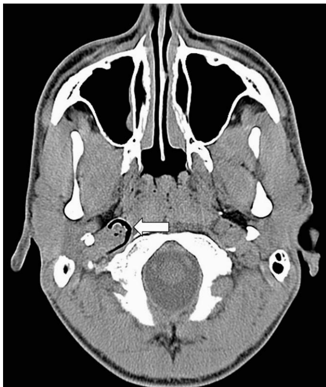
Figure 2 Skull CT-scan showing air in the right jugular foramen (arrow).

cervical spine radiographs were performed that showed a reduction of the air-filled areas. Inspiration/exhalation chest radiographs did not show signs of pleuropulmonary invasion. The patient was discharged with no complications.