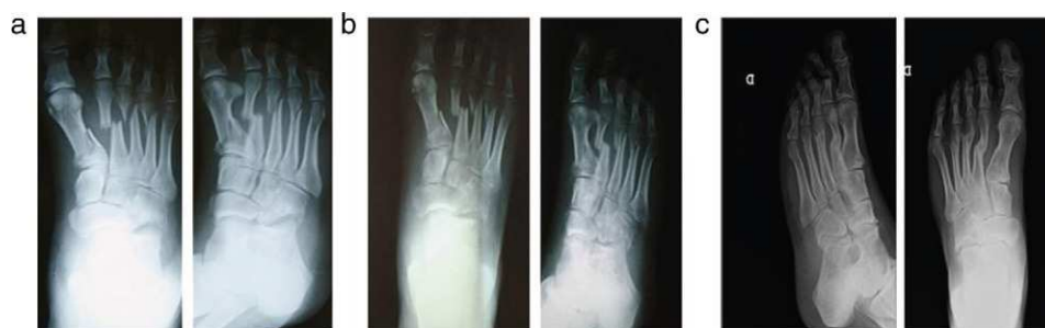
Figure 3 Fracture of metatarsals I, II, III and IV of the right foot treated with the functional method. (a) Simple radiological study at 7 days of evolution; (b) simple radiological study 2 months after the accident; (c) simple radiological study 13 months after the accident.