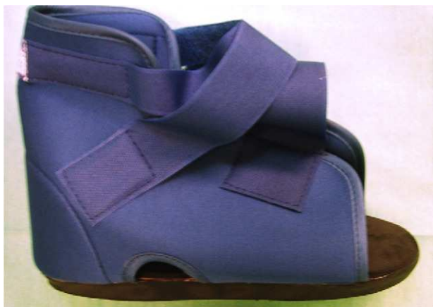
Figure 1 Stiff-soled shoe.

effective weight-bearing before 3 weeks after injury; those with concomitant diseases that lengthened the process; patients with open grade II or III fractures; and those with delayed diagnosis because the fracture was not recognised.