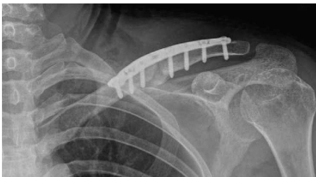
Figure 4 Radiological projection showing the internal fixation and the consolidation of the fracture.

or those with a third fragment of clavicle when more than three weeks had passed since the injury was sustained. Nonetheless, all patients who underwent surgery, with or without graft, achieved bone consolidation.