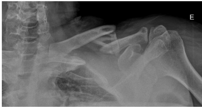
Figure 1 Comminute diaphyseal fracture of the clavicle.

With regard to consolidation, this was achieved with a mean time of 14 weeks (8–42 weeks). For the radiological evaluation of fracture consolidation, the passage of bony bridges between the fracture fragments was observed (Fig. 4). In 7 cases, a computed tomography was also requested to confirm consolidation.