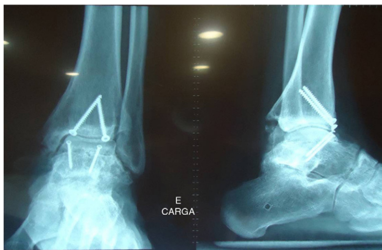
Figure 4 Weight-bearing X-ray of the left ankle 15 months after surgery.

Ankle joint transplants using fresh osteochondral allografts of both surfaces have been sporadically reported in the literature. The concept of biological reconstruction using osteochondral grafts represents an alternative in the treatment of degenerative articular injury. Although the