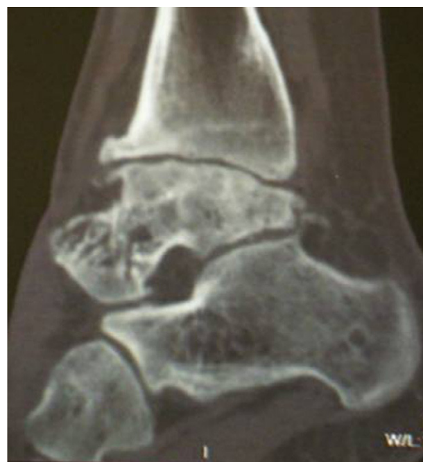
Figure 2 Computed tomography of the left ankle.

The pre-operative evaluation included a complete clinical history and examination, weight-bearing anteroposterior and lateral X-rays of both ankles, and a computed tomography (CT) of the left ankle. An appropriate donor was chosen based on joint size and the transplant was performed 7 days after the donor's death. Blood work was done to detect HIV, syphilis, and hepatitis B and C. The extraction of the donor's ankle consisted of resecting the entire joint, including the capsule and synovial membrane. The implant was carried out through an anterior approach of the ankle, between the anterior tibial and the extensor hallucis longus tendons; the neurovascular pedicle was mobilized and