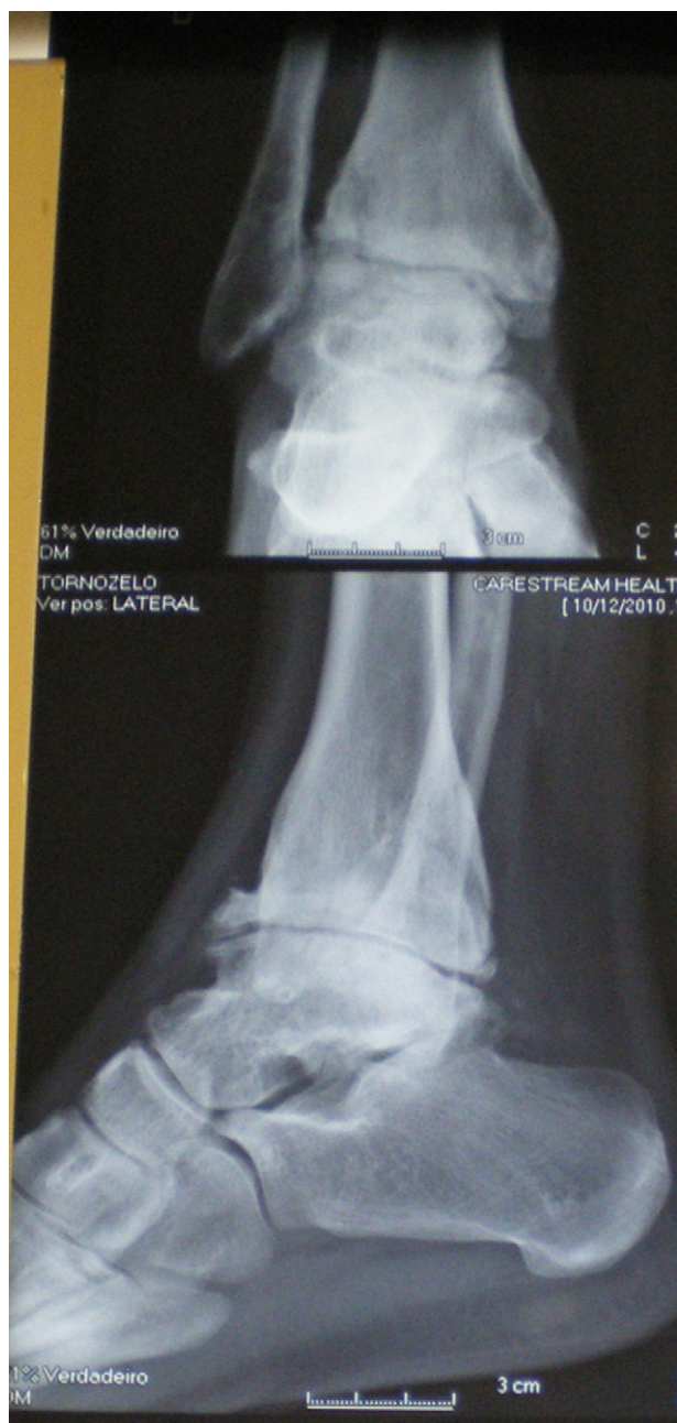
Figure 1 X-ray of the right ankle.