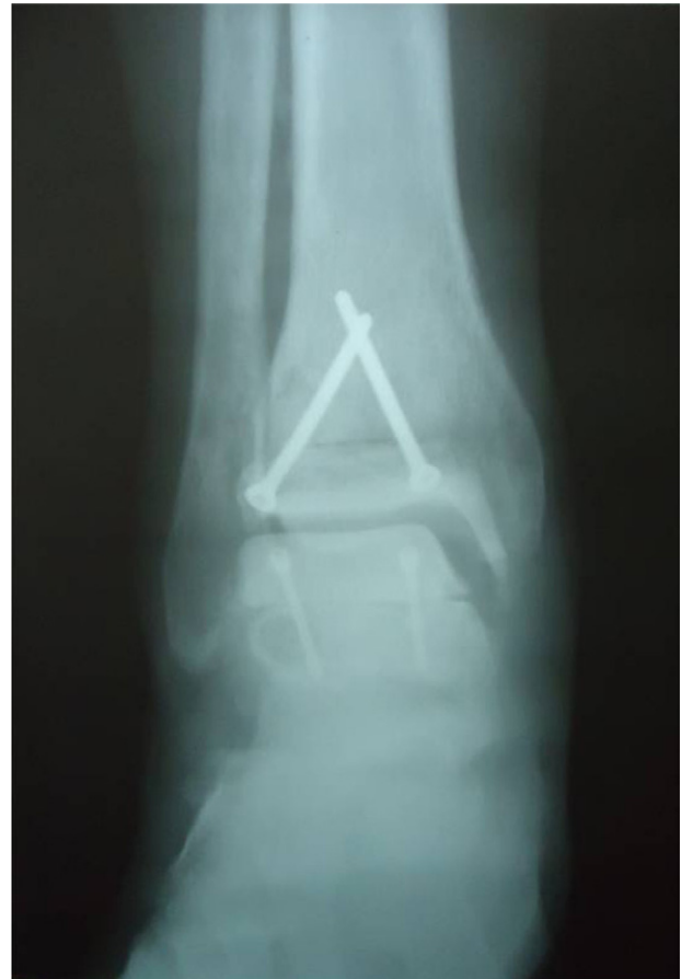
Figure 5 X-ray of the right ankle three months after surgery.

certain degree of osteocondensation (Figs. 5 and 6) three months after surgery, which could generate complications in the future, such as collapse of the graft, osteolysis, and osteonecrosis, previously described in the literature. However, for the time being, the patient is satisfied, asymptomatic, pain-free, and has good mobility in both ankles.